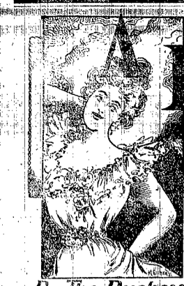
By the Duchess.